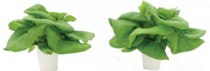
Lettuce 'Rex' 3 weeks after transplant Left Control & Right Fortify (0.25 mL/L)