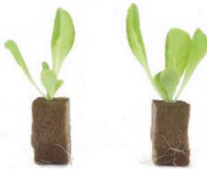
Lettuce 'Rex' 14 days after seeding Left Control & Right Fortify (1 mL/L)

Hydroponic Leafy Greens: Lettuce, Basil, herbs, microgreens, etc.